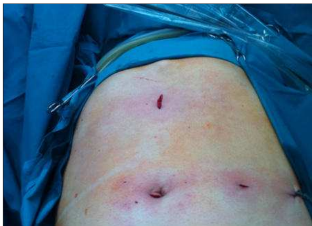
Figure 3. Arrangement of Incisions on the Abdominal Wall

On the first postoperative day, the active drainage set during the surgery was taken out and the patient was discharged for home treatment.