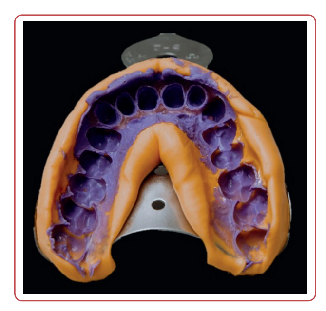
Figure 1: Computer aided surgical simulation (CASS) protocol bite-jig model

The procedure may be carried out by the surgeon, a third-party service provider, or a member of the clinic or institution who is knowledgeable about CASS planning. The procedures for processing data consist of; (1) construction of a virtual model of a composite head - the first stage is to cre-