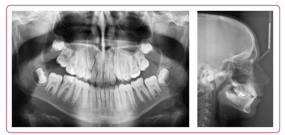
Figure 2: Initial radiographs; panoramic radiography (left) and lateral teleradiography (right).

cluding the developing third molar buds and intraosseal impaction of right permanent canine in the maxilla (Figure 2). The orthopantomogram analysis revealed an increased angle between the maxillary canine and lateral incisors indicating mesial inclination (Figure 2). The CBCT of maxilla demonstrated that the canine was impacted on palatal site. The cephalometric analysis on the lateral cephalogram confirmed a skeletal Class II malocclusion. After the diagnostic analyses was completed, the patient was scheduled for the combined surgical-orthodontic treatment.