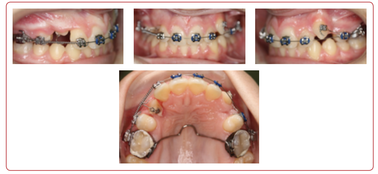
Figure 3: Orthodontic traction of the canine into the dental arch.

that, the first premolars were extracted, brackets were placed on all teeth and a 0.012 nickel-titanium (NiTi) arch wire was applied. In this case the metal brackets of 0.018 slot were used. Open coil spring was positioned between 1.2 and 1.4 to increase the space for the permanent canine. Levelling and alignment phase was done by wire sequences of 0.012", 0.014", 0.016", 0.018", 0.016" x 0.022" NiTi, followed by 0.016" x 0.022" stainless steel arch wire. After orthodontic initial phase was completed the surgical exposure of 1.3 was performed using an open eruption technique. Surgical circular excision of the overlying palatal mucosa was performed and a small amount of bone covering the impacted canine was removed. The enamel surface of the impacted canine was washed and dried and then an orthodontic button with a chain for the guided traction was bonded at the crown level. Three weeks later the patient