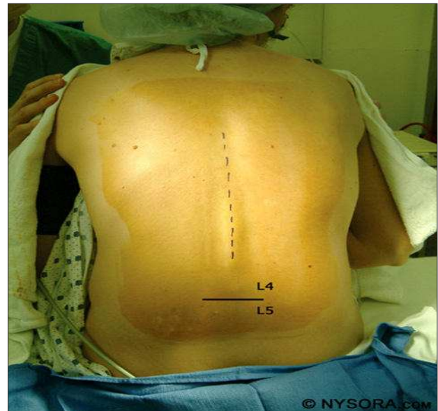
Figure 1. Position of the Patient for Performing Spinal Anesthesia and Level of Puncture

The electrocardiogram (rhythm, frequency) was monitored continuously, the second drain, through the MEDIA YG 6000 monitoring device. Three types of surgery were performed: surgery on the lower extremities, inguinum and urological operations.